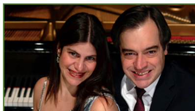
The Witkowski Piano Duo